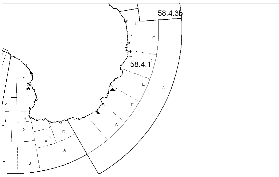
Figure 1: General map of Division 58.4.1 and location of SSRUs (A–H in that division).

2. In 2005/06, the exploratory fishery for Dissostichus spp. in Division 58.4.1 was limited to Australian, Chilean, Korean, New Zealand, Spanish and Uruguayan vessels using longlines only (Conservation Measure 41-11). The precautionary catch limit for Dissostichus spp. was 600 tonnes, of which no more than 200 tonnes could be taken in SSRUs C, E and G (see Figure 1). Five other SSRUs (A, B, D, F and H) were closed to fishing. Fishing was prohibited in depths less than 550 m in order to protect benthic communities. The catch limits for by-catch species were defined in Conservation Measure 33-03. The fishing season was from 1 December 2005 to 30 November 2006.