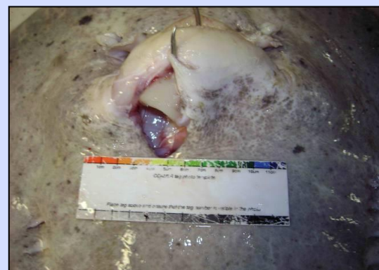
More extensive hook damage (3)