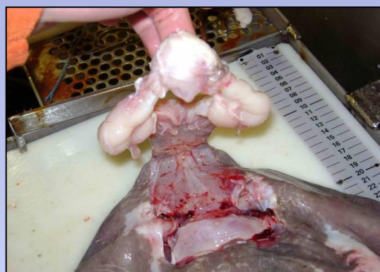
Extensive damage to mouth (soft tissue & jaw bone) (1 or 2)