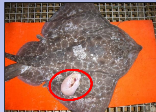
External organs protruding from body cavity (1 or 2)