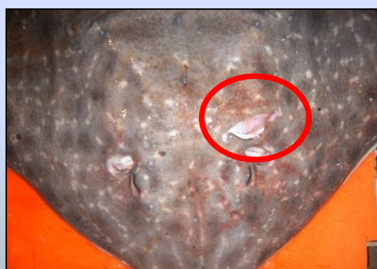
Minor damage to skin, not penetrating body cavity (4)