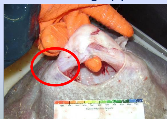
Soft tissue damage, corner of jaw bone not exposed (3)

PLEASE RETURN ALL TAGS AND RECORD TAG NUMBERS ACCURATELY