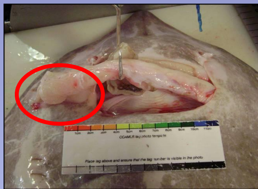
Corner of jaw exposed (1 or 2)