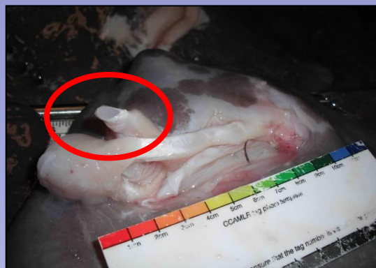
Broken jaw bone (1 or 2)

skates with severe injuries, which are unlikely to survive or are already dead