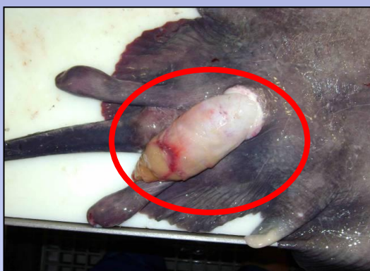
Large part of intestine visible (1 or 2)