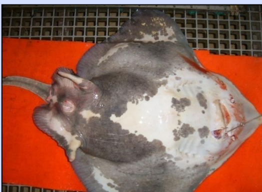
Minor hook damage, no other injuries (4)