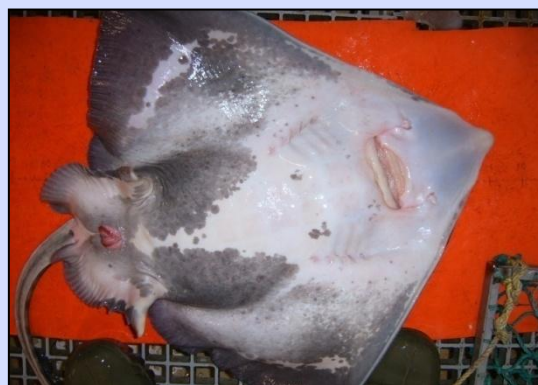
No apparent damage (4)

skates that have minor injuries and which have a good chance of survival