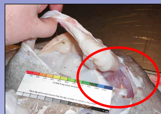
Corner of jaw exposed (1 or 2)